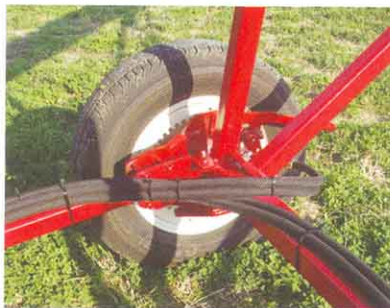
Hydraulic Wheel Drive